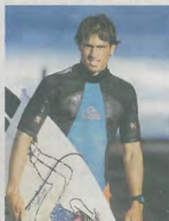
From left: 'Roo looking at me?'; Whitehaven beach, in the Whitsundays; Baywatch, Sydney; moonrise in Karijini National Park; a dainty tree frog at Mossman Gorge; the Perth skyline; and a surf lesson on Byron Bay