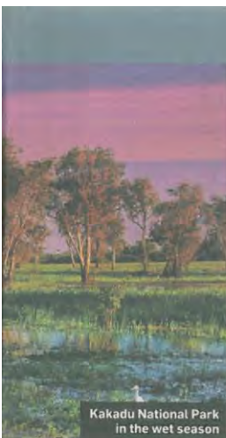
Kakadu National Park in the wet season

The websites of the state tourist boards are well worth visiting when planning your trip. Visit visitvictoria.com ; southaustralia.com ; discovertasmania.com ; tourismnt.com ; westernaustralia.com.au ; and queenslandholidays.com.au .