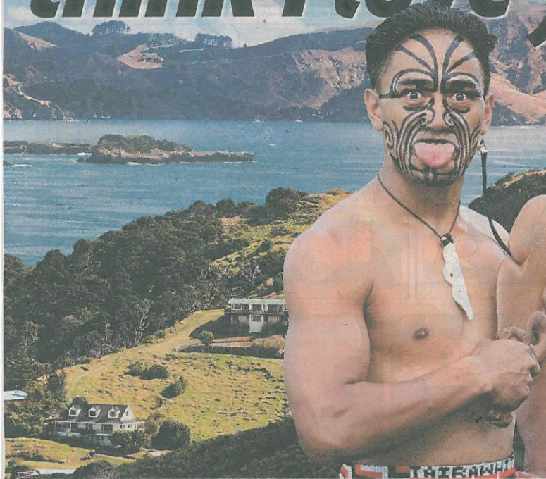
Waitangi Treaty grounds — the birthplace of the modern New Zealand.

The treaty was signed by Captain William Hobson of the Royal Navy, on behalf of the British Crown, and local Maori leaders, in a marquee on the lawn.