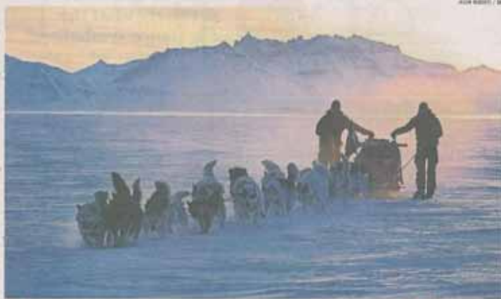
404 8880 / 36

◀ 1910-13 British Antarctic Expedition for scientific research and served as a base for the explorer's journey. The five-star expedition ship Orion has only 100 passengers on board and there are creature comforts such as a gym and boutique, and hairdressing, sauna and massage facilities. There are also specialist lecturers and a polar expedition team for venturing on to the ice. Details From £12,990pp for 20 nights on board. The price includes all meals and excursions. International flights are extra. Departs January 21 (020-7399 7620, orionexpeditions.com).