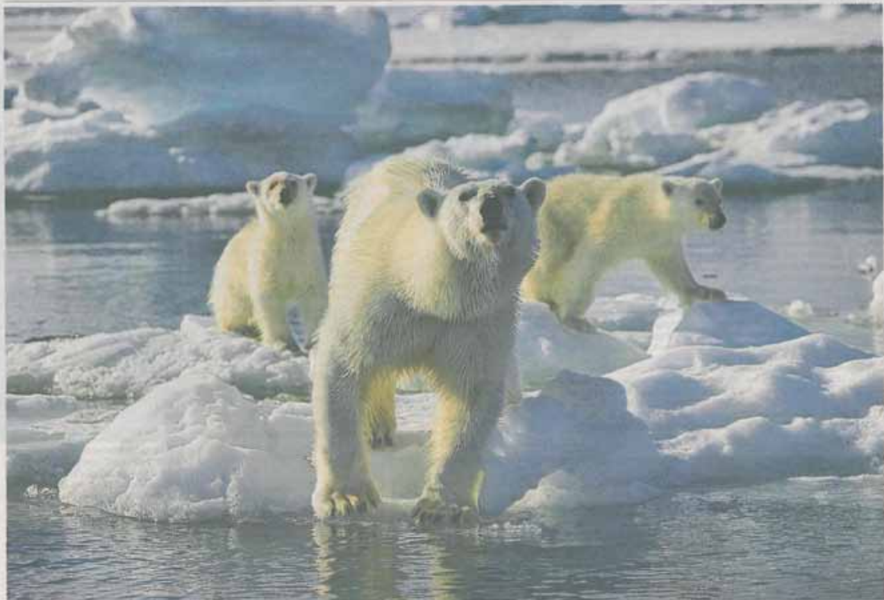
You can see polar bears in Canada or off the northern Siberian coast in the Russian Arctic.

'I never found out precisely what the Pig Dance symbolised' Stanley Johnson in French Polynesia